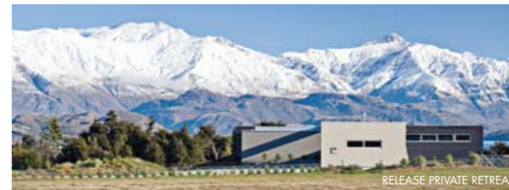
RELEASE PRIVATE RETREAT