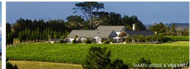
TAKATU LODGE & VINEYARD