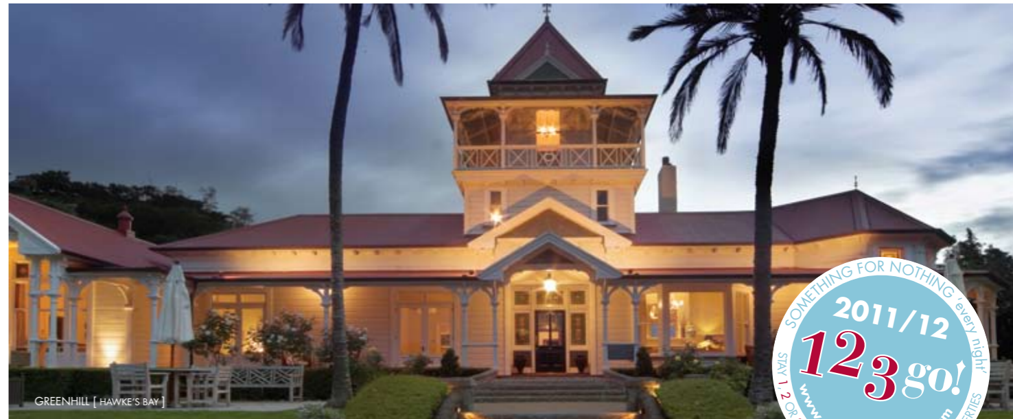
GREENHILL [HAWKE'S BAY]

3RD NIGHT: A cruise for two on Lake Wakatipu on the vintage steamship SS Earnslaw, the Lady of the Lake