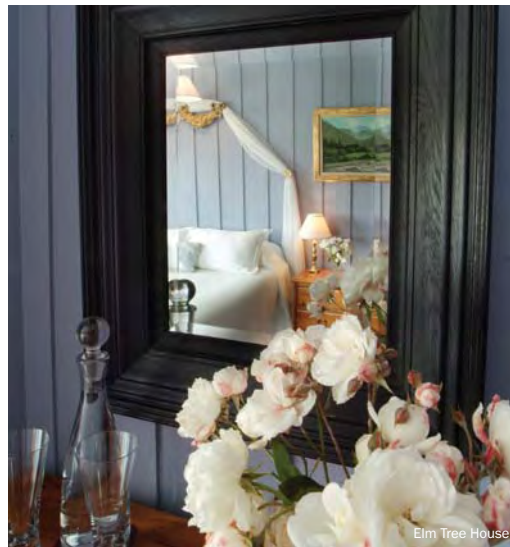
Elm Tree House

A dedicated spa room, as well as being just minutes from one of New Zealand's leading golf courses, Formosa.